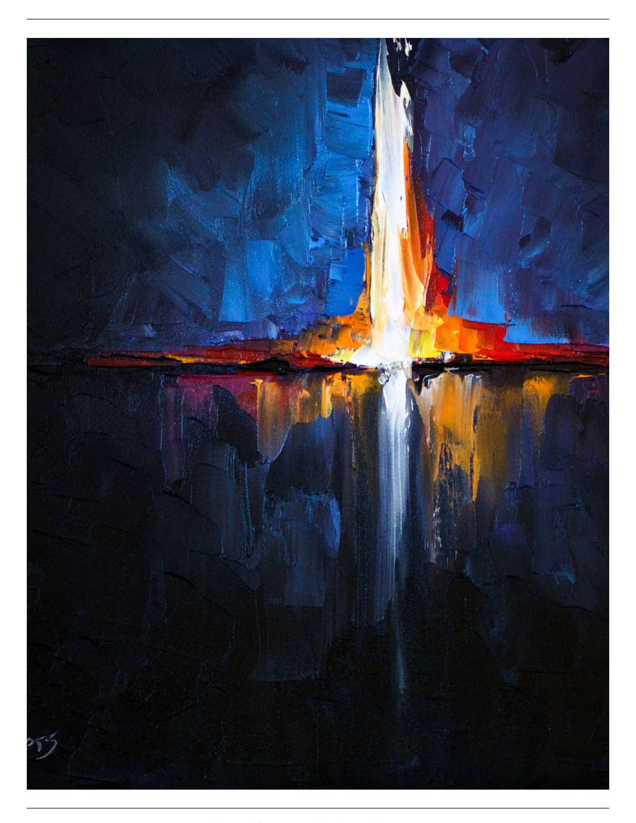
"The Lord is My Light" by Mike Moyers

\begin{array}{c} \text{Epiphany Sunday} \\ \text{January 5, 2025} \\ 8:30, 9:30 \& 11:30 \text{ am Worship} \end{array}