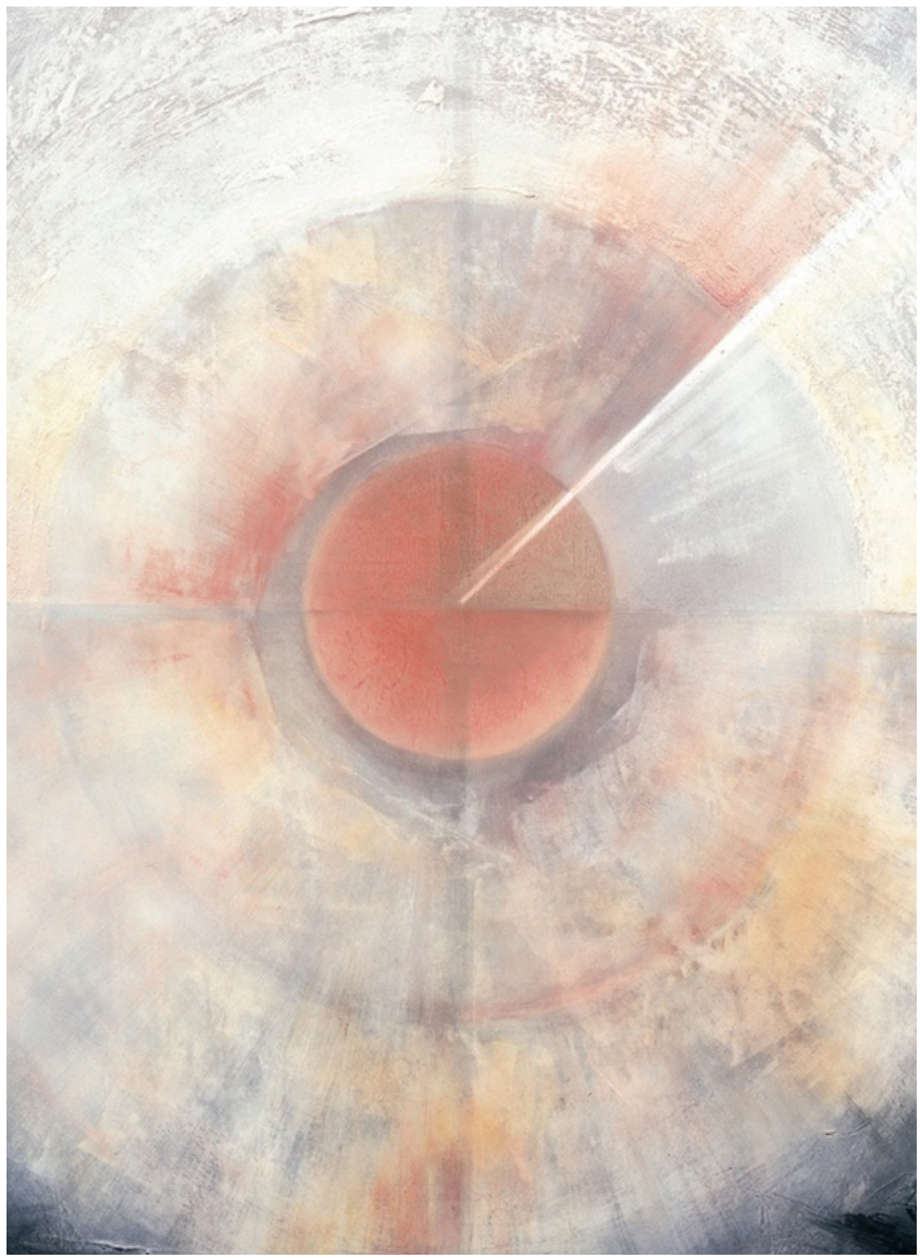
PEACE by Anneke Kaai

In the Old Testament shalom indicates living in a healthy relationship with God, oneself and the environment. The heart of the light, round shape here symbolizes the inner person, the white band above pictures God, and the shape below refers to the surrounding world. Through Christ peace with God and the environment is possible, which is why the cross dominates the composition. The inner peace that results is pictured as a rising sun (the moment of peace in nature).