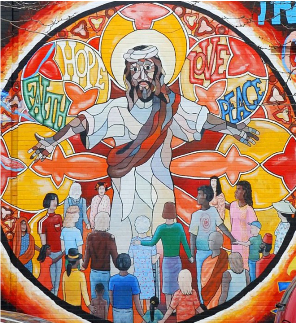
Jesus Mural of Faith, Hope, Love, and Peace from Art in the Christian Tradition, a project of the Vanderbilt Divinity Library, Nashville, TN

FOURTH SUNDAY after EPIPHANY February 2, 2025 8:30, 9:30 & 11:30 am Worship