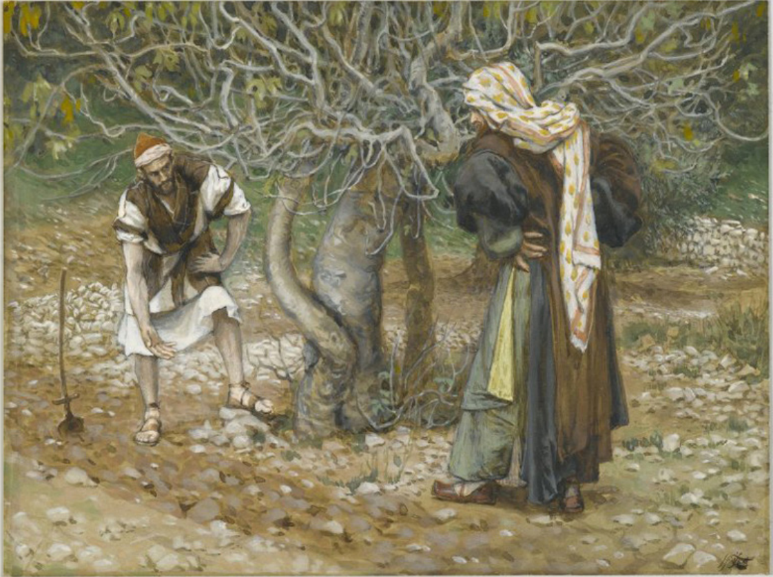
The Vine Dresser and the Fig Tree by James Tissot

THIRD SUNDAY in LENT March 23, 2025 8:30, 9:30 & 11:30 am Worship